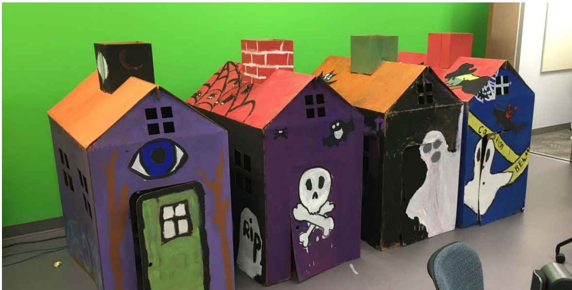
"HACK HOUSES" used as a part of the RUSECURE Capture The Flag Championship on April the 27 th at Radford University

THE RADFORD UNIVERSITY ARTIS COLLEGE OF SCIENCE AND TECHNOLOGY NEWSLETTER