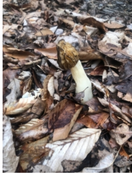
A morel found on the wildflowerwalk.