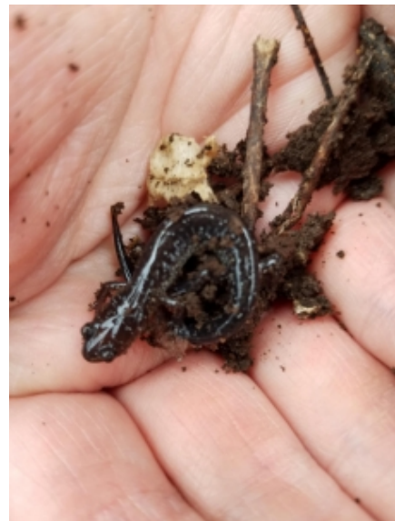
Northern slimy salamander.