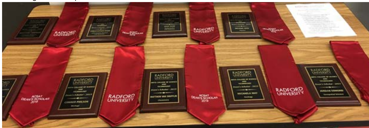
Dean's Scholar Plaques and Stoles