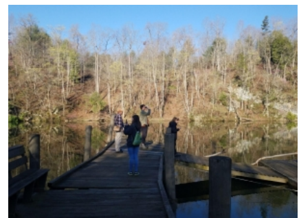
Birding on the Little River.