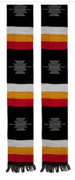
Native American Stole