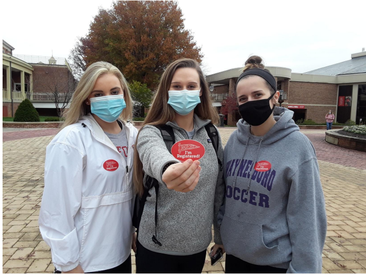
I'm Registered Campaign